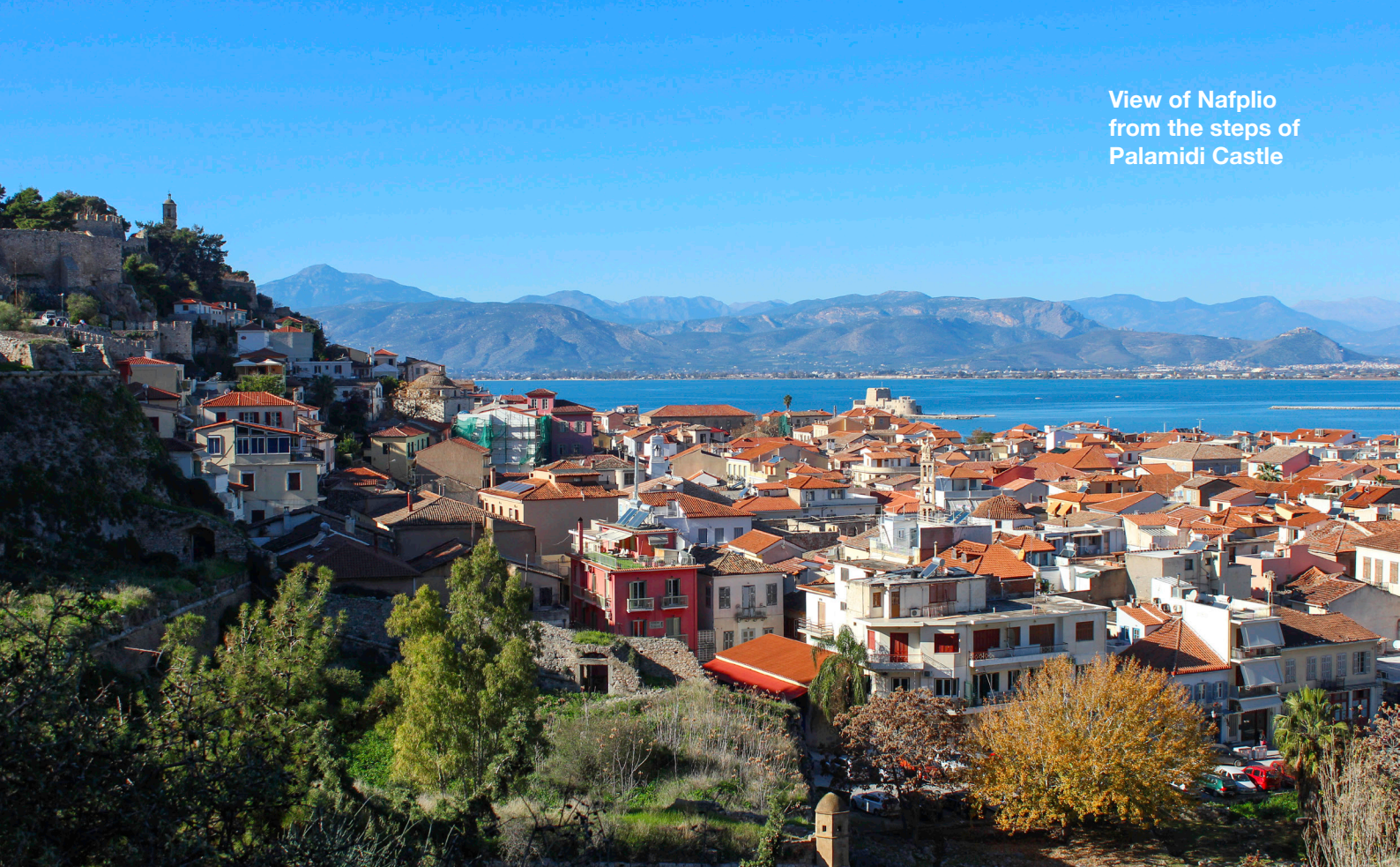
View of Nafplio from the steps of Palamidi Castle